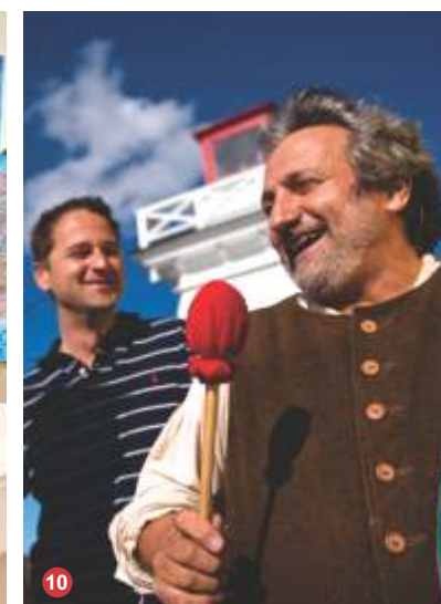
Historic Walking Tours & Lighthouse