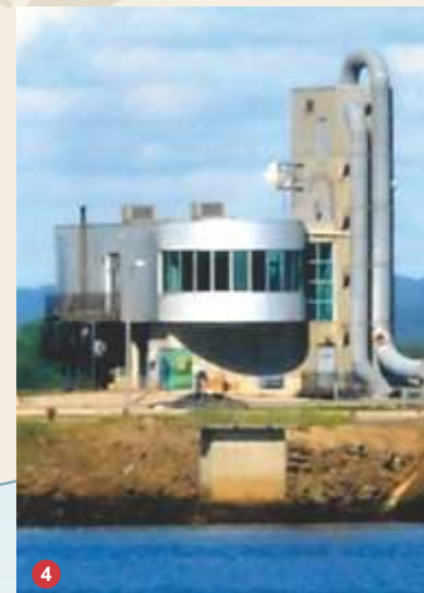
Old Tidal Power Plant (Closed)