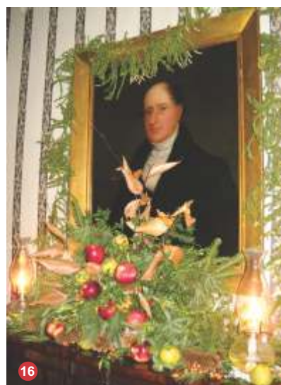
O'Dell House Museum