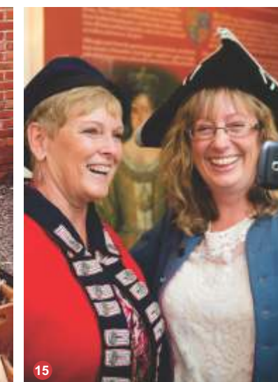
Fort Anne National Historic Site