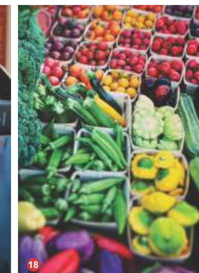
Farmers and Traders Market