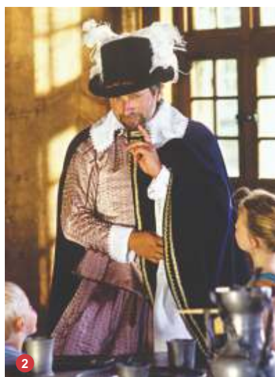
Port-Royal Habitation NHS