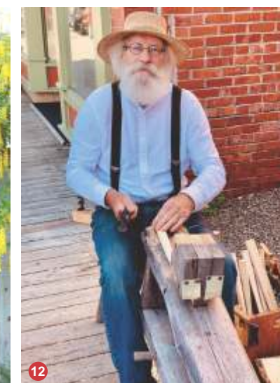
Sinclair Inn Museum