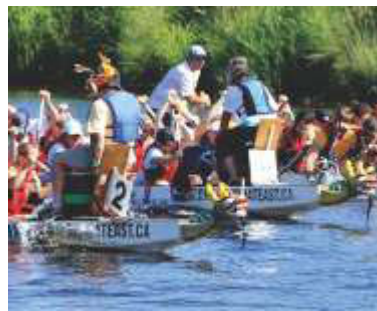
Annapolis River Festival