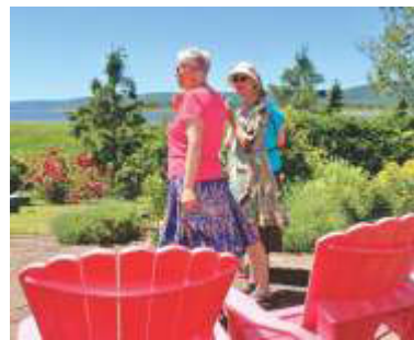
House & Garden Tour

CELEBRATE MAGNOLIAS May 1 - 15 Enjoy more than 100 magnolias in Annapolis Royal and the Historic Gardens. www.historicgardens.com