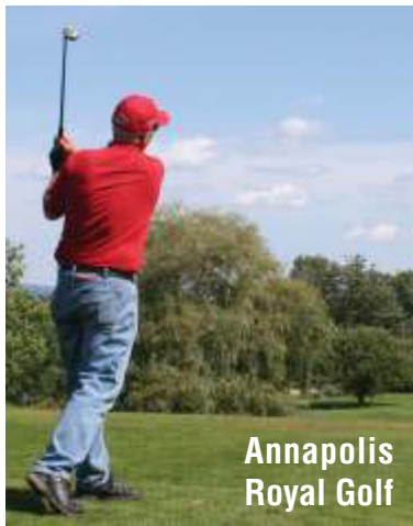
Annapolis Royal Golf