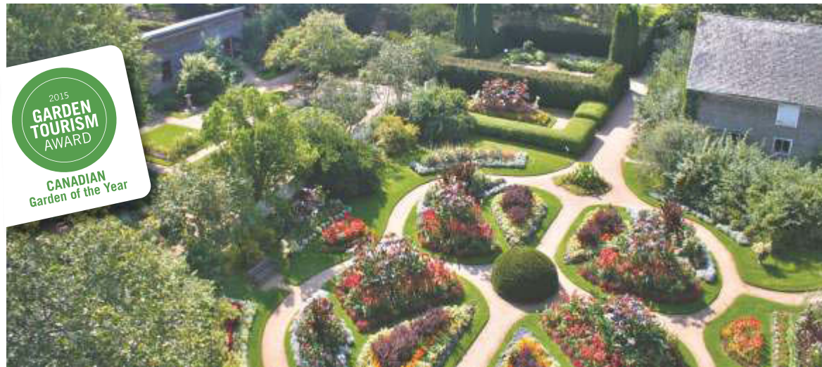
Annapolis Royal is home to the world class Historic Gardens, one of Nova Scotia's Top Attractions on Trip Advisor. An essential part of your vacation experience - #cultivatingmemories.