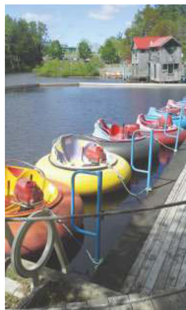
Upper Clements Parks feature 31 rides and attractions at the Amusement Park and challenge courses, ziplines and drop tower at the Adventure Park.