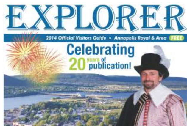
Back to Homepage of The Explorer

The EXPLORER, Serving Annapolis Royal, Nova Scotia & Area since 1995