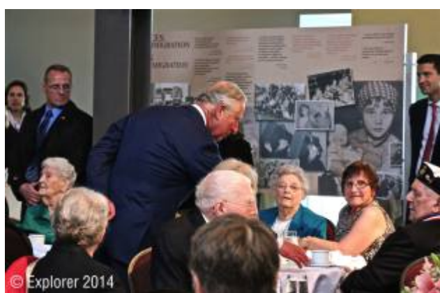
Their Royal Highnesses Visit to Pier 21