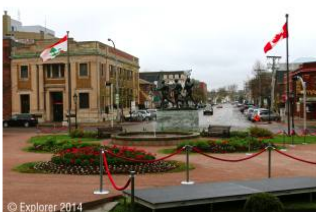
Province House & Confederation Centre