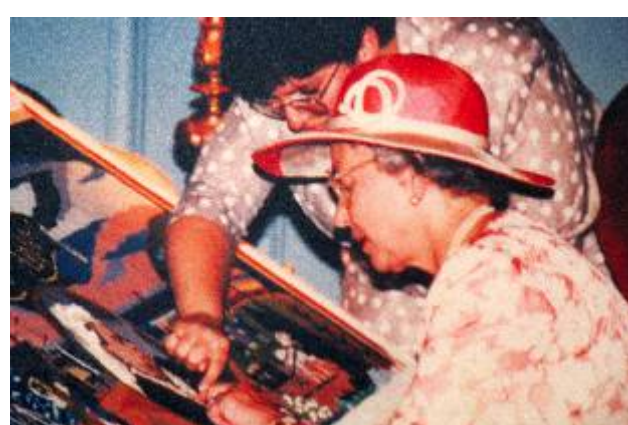
Annapolis Royal - More Monarchy Links