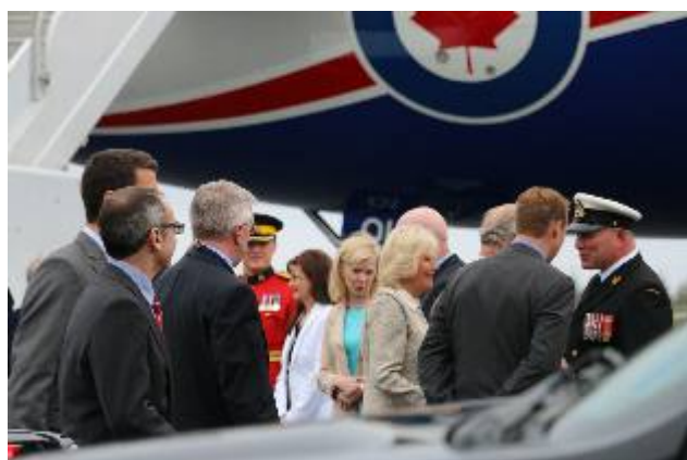
Royal Party Arrives in Halifax, NS