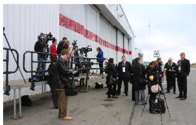
Behind the Scenes - Covering the Story