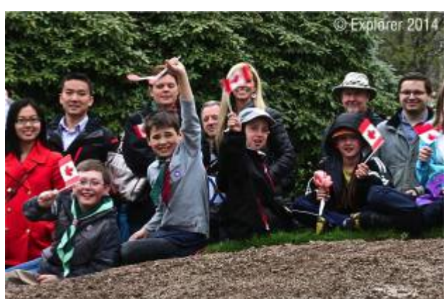
Faces in the Crowd