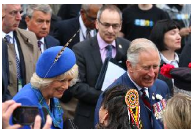
2014 Royal Tour Video - Coming Soon