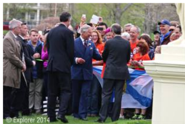
Visit to Halifax Public Gardens