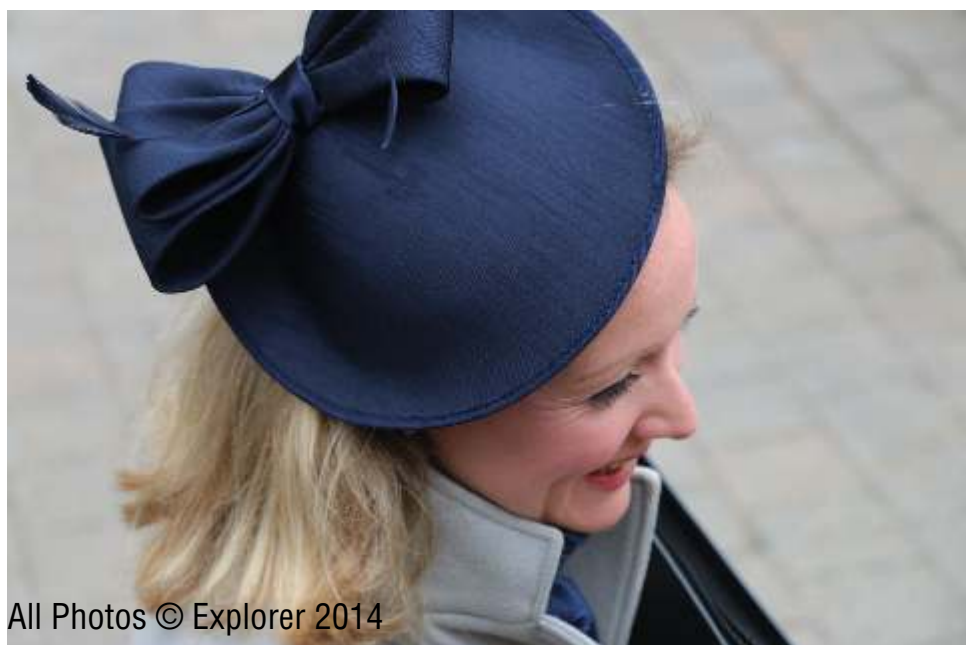
All Photos © Explorer 2014