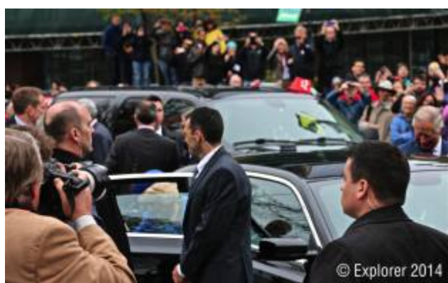
Behind the Scenes - Making It Happen