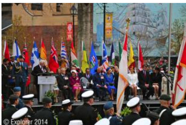
Official Welcome - Grand Parade