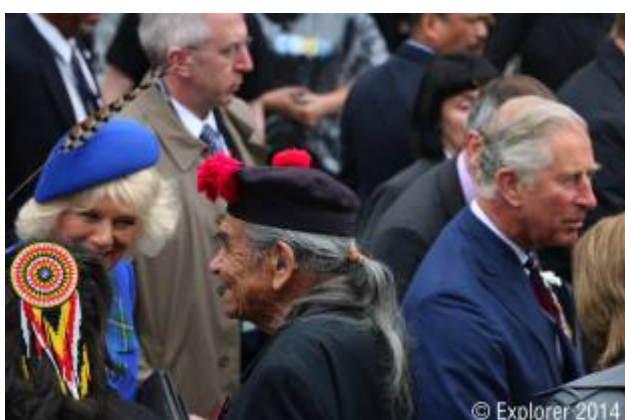
2014 Royal Tour - Why This Year?