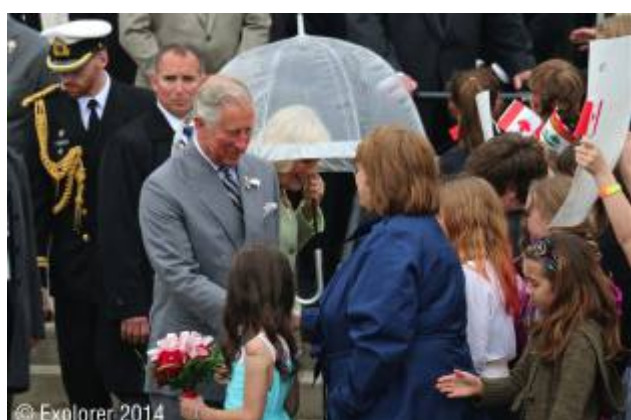
The Royal Couple Visits Cornwall, PEI