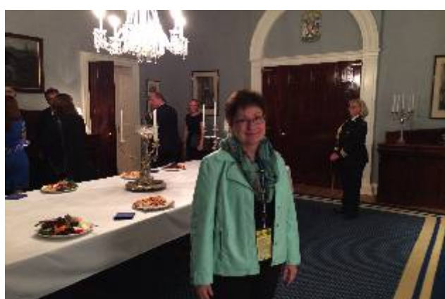
On a Personal Note