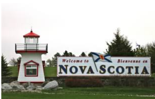
Behind the Scenes - Getting Us There