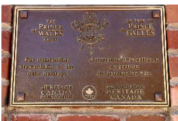
Annapolis Royal - Links to the Monarchy