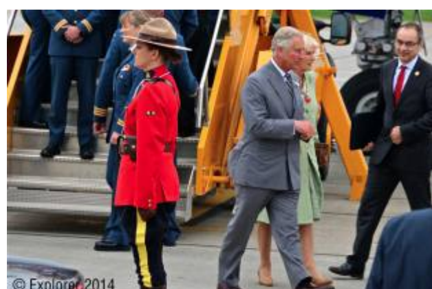
The Royal Couple Departs for Manitoba