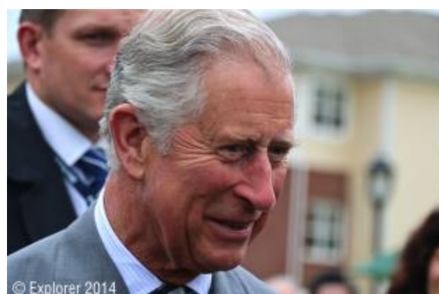
Prince Unveils Plaque at Holland College