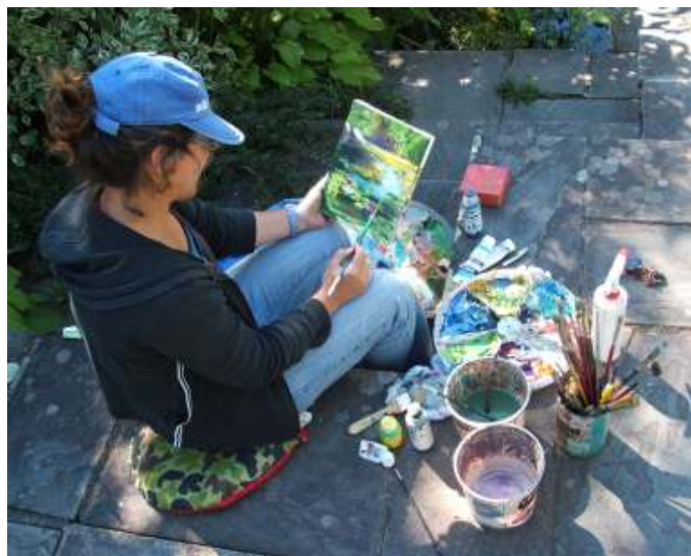
The first Paint the Town © took place in August 1996, with 25 artists coming to paint on site around the historic town of Annapolis Royal. Today it has grown into the anchor fund raising event for the colourful Annapolis Region Community Arts Council. (ARCAC)

Paint the Town © is the anchor fund raising event for the Annapolis Region Community Arts Council (ARCAC) and its artist-run gallery, ARTsPLACE. The 15th annual event is on tap for Aug. 21 - 22 and will feature over 100 artists and crafts people creating works of art inspired by this beautiful, historic town.