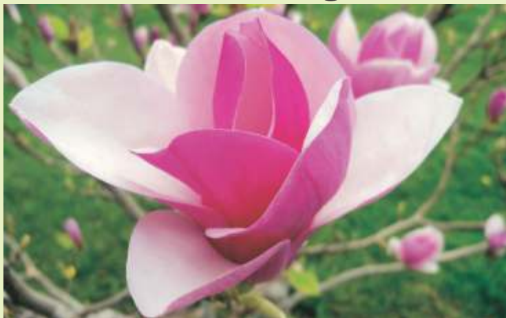
Magnolia soulangeana Rustica Rubra , one of the many types. (Waldow)

Annapolis Royal's 4th annual Magnolia Celebration will be full of beautiful fragrant magnolia blossoms which bloom from the end of April throughout May and into June. The "Inspired by Magnolias" art show runs May 1 - May 29 at ARCAC.